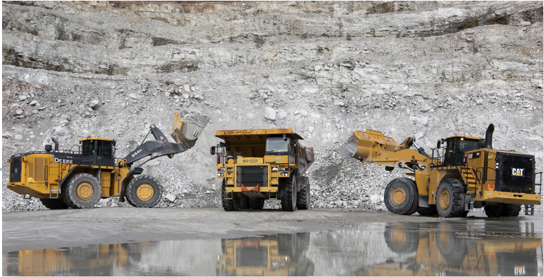
example from Boscobel site