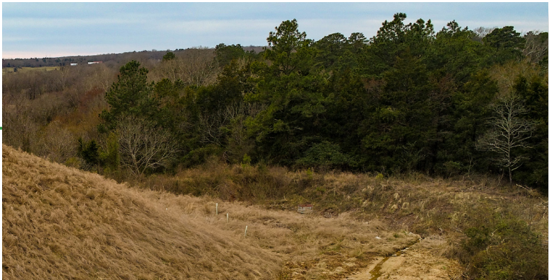
example from Prince Edward site