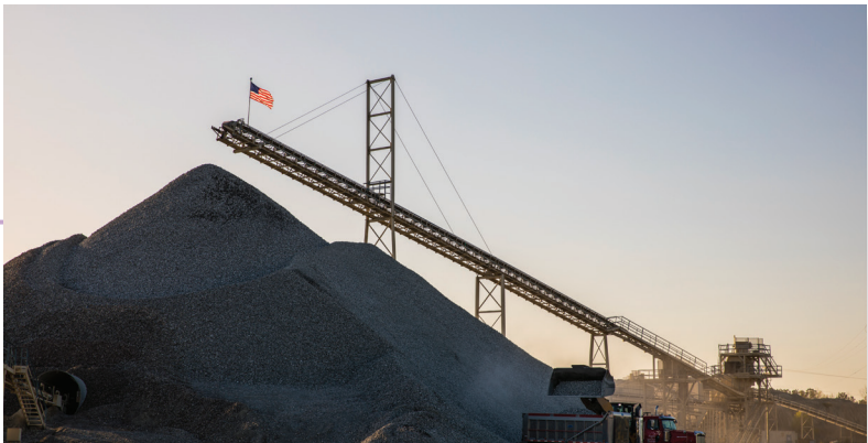
example from Rockville site